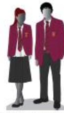
Senior blazer - to be Worn with shirt and tie, Vest or Jersey only (no hoodie)