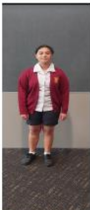
School Shorts and cardigan Junior shirt, plain white socks, plain black shoes