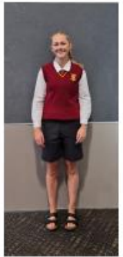
Senior vest, shirt and tie, school shorts Plain Black Birkenstock Sandals with backtrap