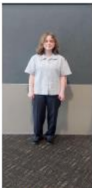
School trousers Junior shirt, plain black shoes