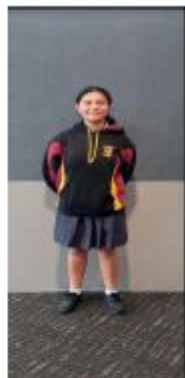
School hoodie, school Skirt, plain white socks, Plain black shoes