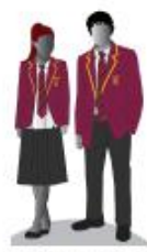
Executive Leader blazer - Worn with shirt and tie, Vest or Jersey only (no hoodie)