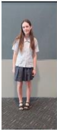
School skirt, Junior shirt Black RomanSandals