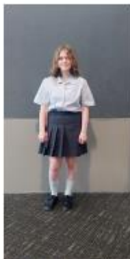
School skirt Junior shirt, plain white socks, plain black shoes