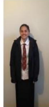
Senior school shirt and tie Plain black Jacket, plain Black lavalava