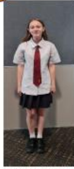
Senior fitted shirt and tie, grey skirt Plain white socks Plain black Shoes