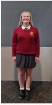
School Jersey and skirt Senior shirt and tie Plain black shoes, plain white socks