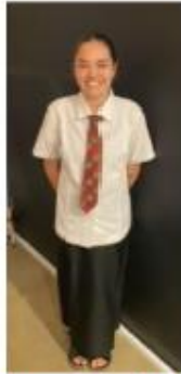
Senior shirt and tie, plain Black Lavalava, plain black Roman Sandals