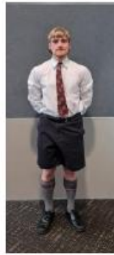
Senior unfitted, long sleeve shirt, school shorts, grey socks, plain black shoes