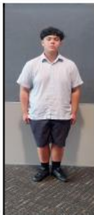
School shorts, Junior shirt, plain black socks, plain black shoes