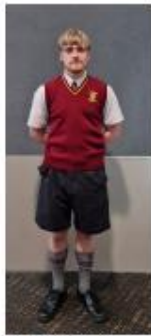
Senior vest, shorts Senior shirt and tie Plain black shoes