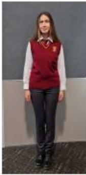
Senior vest, shirt and tie Plain black shoes