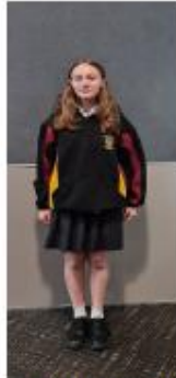
School hoodie, skirt Plain white socks Plain black shoes